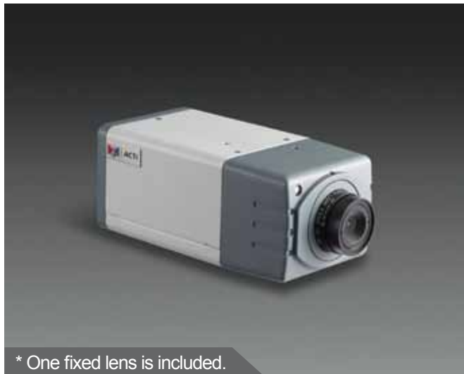
* One fixed lens is included.